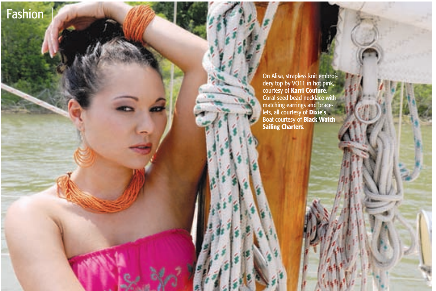
On Alisa, strapless knit embroidery top by VO11 in hot pink, courtesy of Karri Couture . Coral seed bead necklace with matching earrings and bracelets, all courtesy of Dixie's . Boat courtesy of Black Watch Sailing Charters .